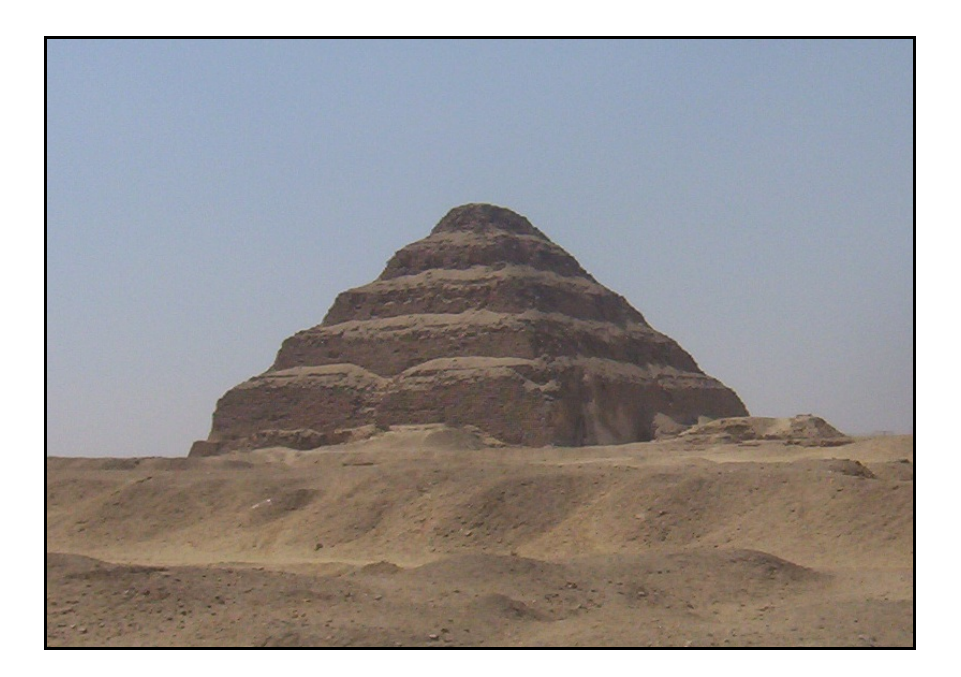
Figure 1. The stepped pyramid of Djoser at Saqqara.

In addition, a great deal of cost was involved in pyramid building on the scale that we see, not only in the Saqqara complex, but also in the Giza and other pyramids that followed. According to the biblical story, the pharaoh became enormously wealthy from sale of the grain gathered during the seven plentiful years to both his people and to those who came from foreign countries to buy (such as Joseph's brothers, noted in Gen. 42–43). The ongoing 1/5 income tax that Joseph instituted would also have continued to pour money into the pharaoh's coffers year after year (Gen. 47:26). The sudden available wealth displayed in Djoser's reign by his building program fits the biblical account well if Joseph was Imhotep.